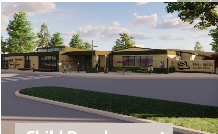
Child Development Center